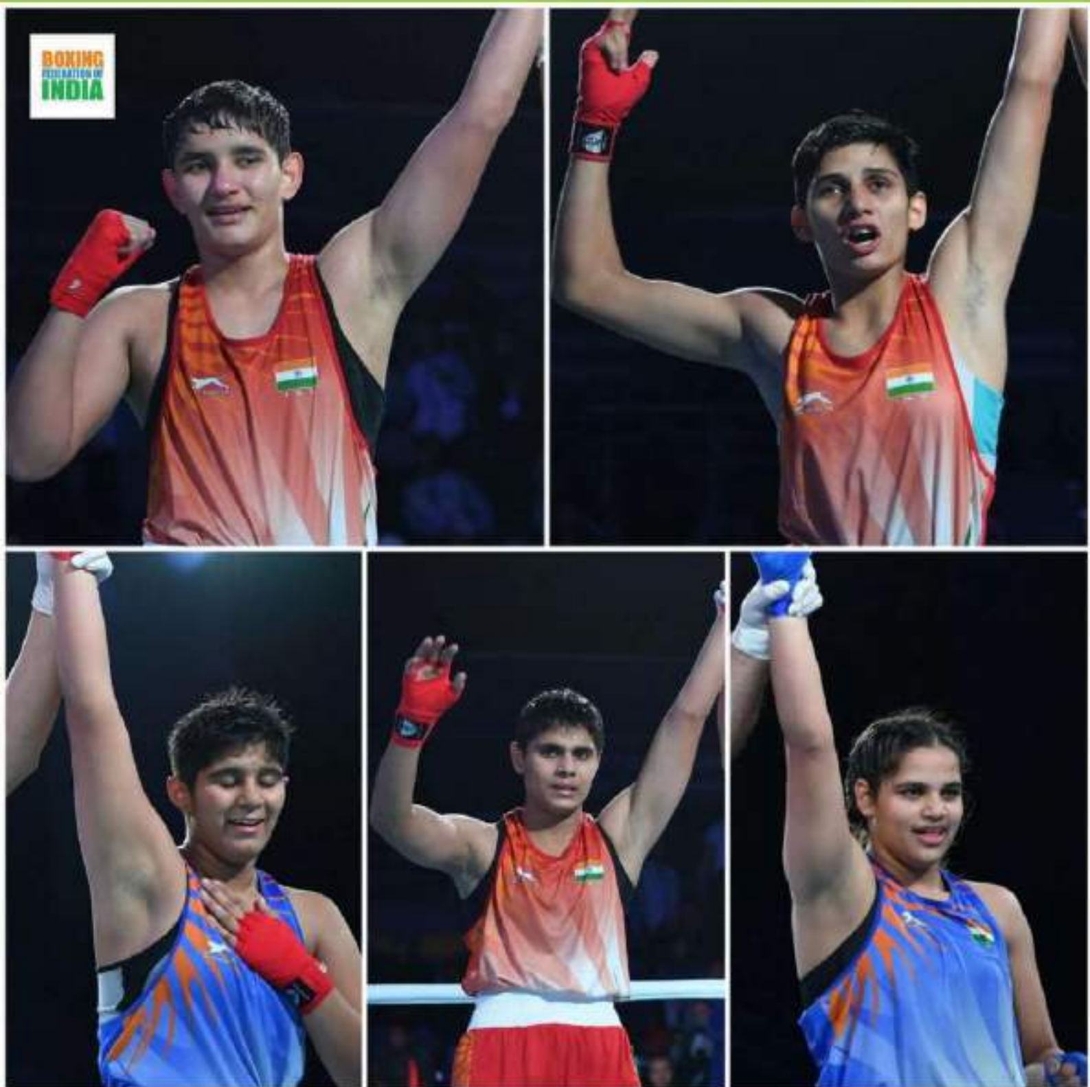
Junior Girls Gold Medallist in ASBC Asian Junior Championship 2023, Kazakhstan