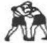
13 BOTH COMPETITORS ARE WRESTLING