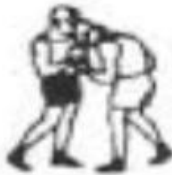
9 PULLING AND HITTING