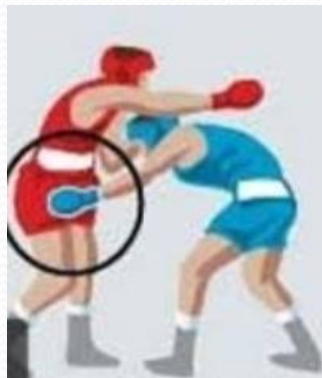
Hitting below the belt