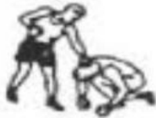
1 HITTING AN OPPONENT WHO IS DOWN