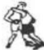
11 HANGING ON TO OPPONENT