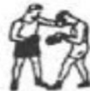
14 HIT WITH THE FOREARM