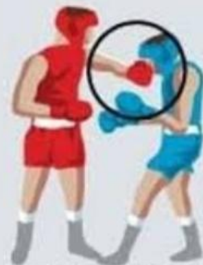
Hitting with the forearm