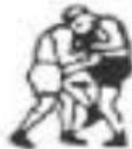
3 KICKING WITH THE KNEE