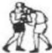
9 PULLING AND HITTING