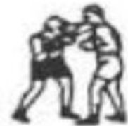
7 HIT WITH THE ELBOW