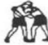
13 BOTH COMPETITORS ARE WRESTLING