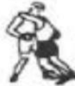
11 HANGING ON TO OPPONENT