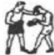
14 HIT WITH THE FOREARM