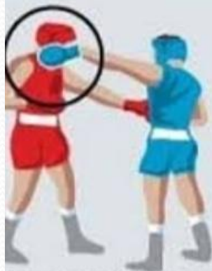
Hitting with the open glove