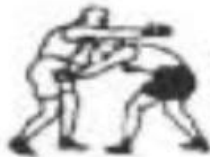
2 HITTING BELOW THE BELT