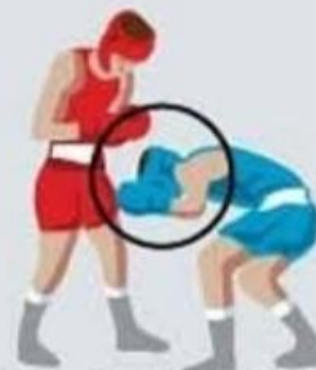
Ducking below the belt line