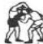
6 ANY BLOW ON BACK OF HEAD