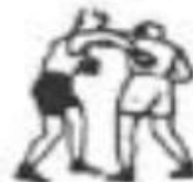
4 HITTING ON THE BACK