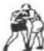
10 HOLDING AND HITTING