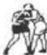
10 HOLDING AND HITTING