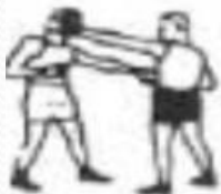
8 HITTING WITH THE OPEN GLOVE