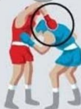
Any blow on back of neck