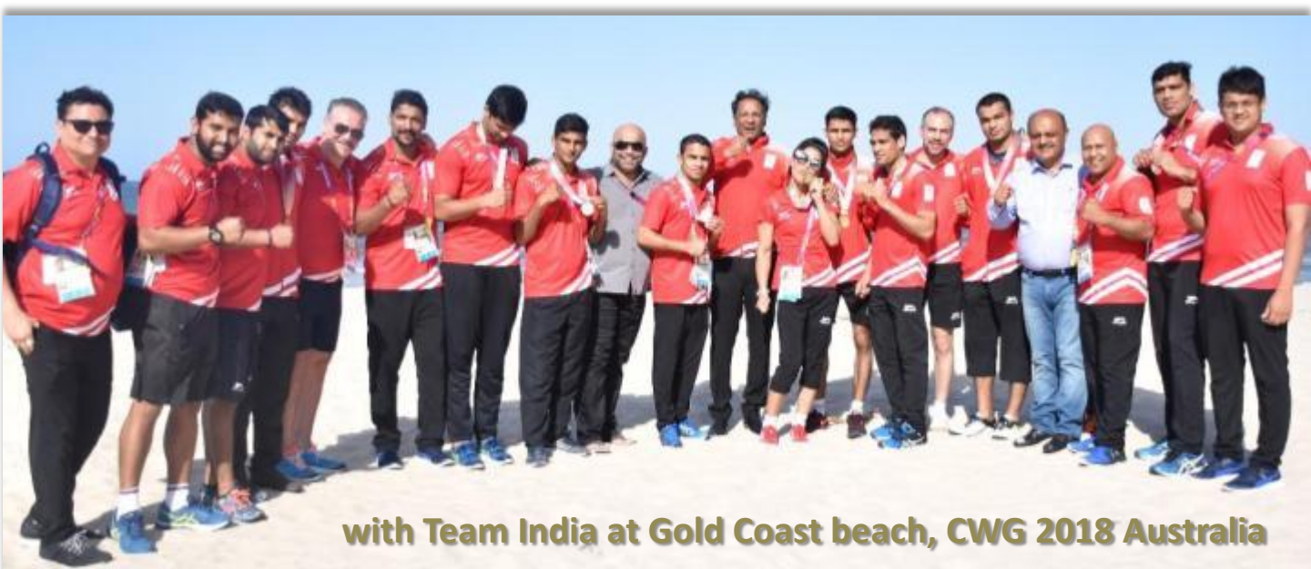
with Team India at Gold Coast beach, CWG 2018 Australia