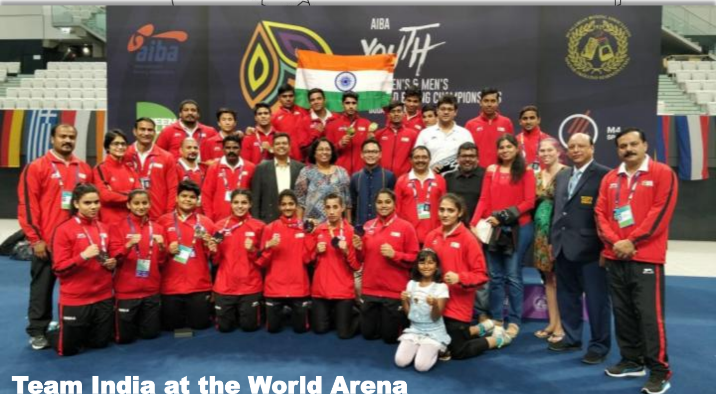
Team India at the World Arena