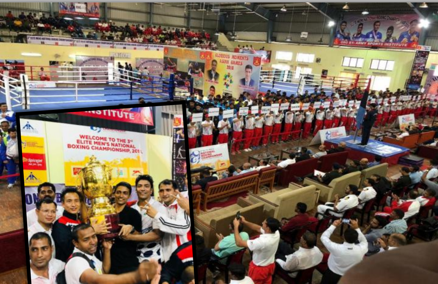
a typical disciplined EMN show by SSCB at Army Sports Institute, Pune !

3 rd EWN : 31 st Dec 2018 to 6 th Jan 2019 at Bellary, Karnataka