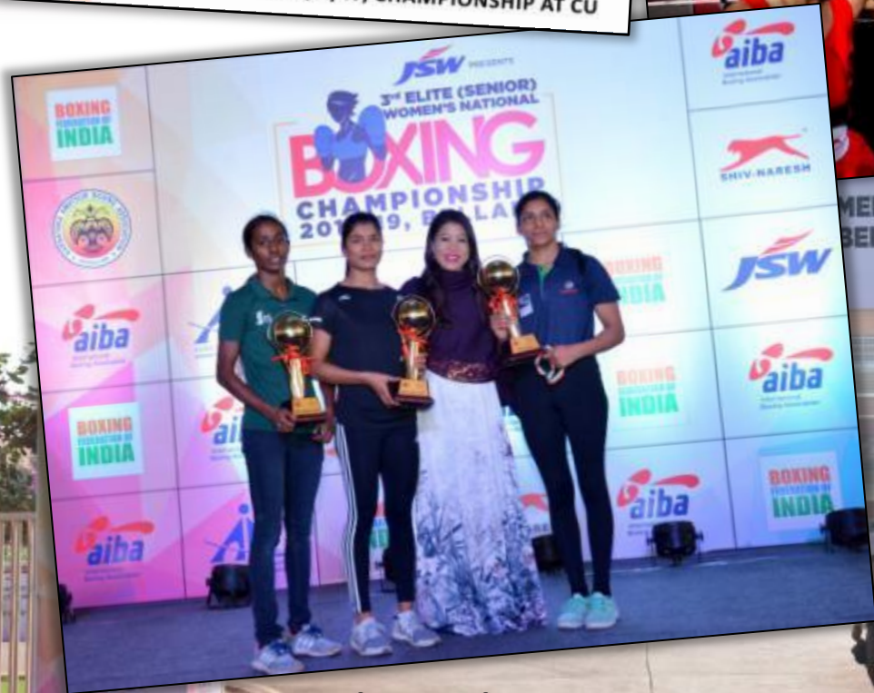
Grand EWN Show by JSW at Bellary, Karnataka !!